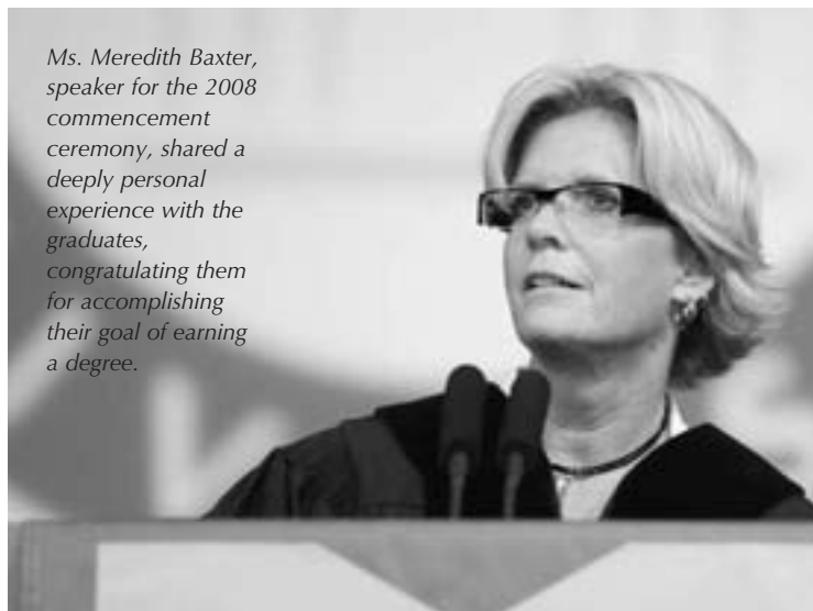
Ms. Meredith Baxter, speaker for the 2008 commencement ceremony, shared a deeply personal experience with the graduates, congratulating them for accomplishing their goal of earning a degree.

The combined National University Class of 2008 was comprised of 4,515 graduates, with 75 percent earning master's degrees, 23 percent accepting bachelor's, and two percent receiving associate's. The largest number of graduates – 54 percent – came from the School of Education. The College of Letters and Sciences provided 24 percent, the School of Business and Management 14 percent, the School of Engineering and Technology four percent, and the Schools of Health and Human Services and Media and Communication each provided two percent of the total graduates. /