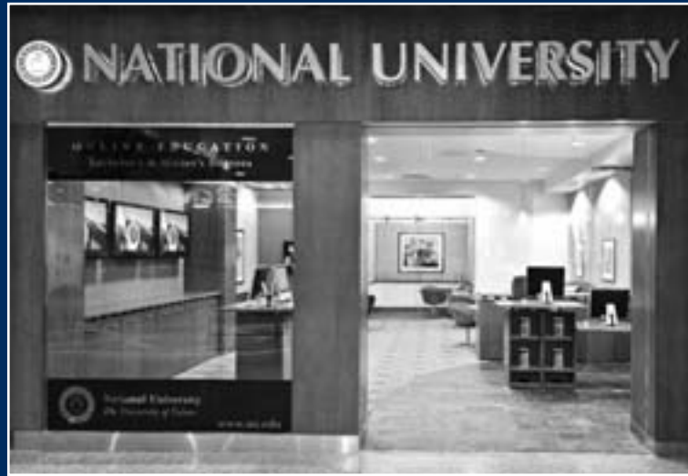
National University opened Online Information Centers in Sacramento, Temecula, and West Covina earlier this year.

Earlier this year, National University continued that trend with the opening of three new Online Information Centers. The goal of the Online Information Centers is to introduce prospective students to the University's extensive online offerings by using computers, interactive demos, and educational tools